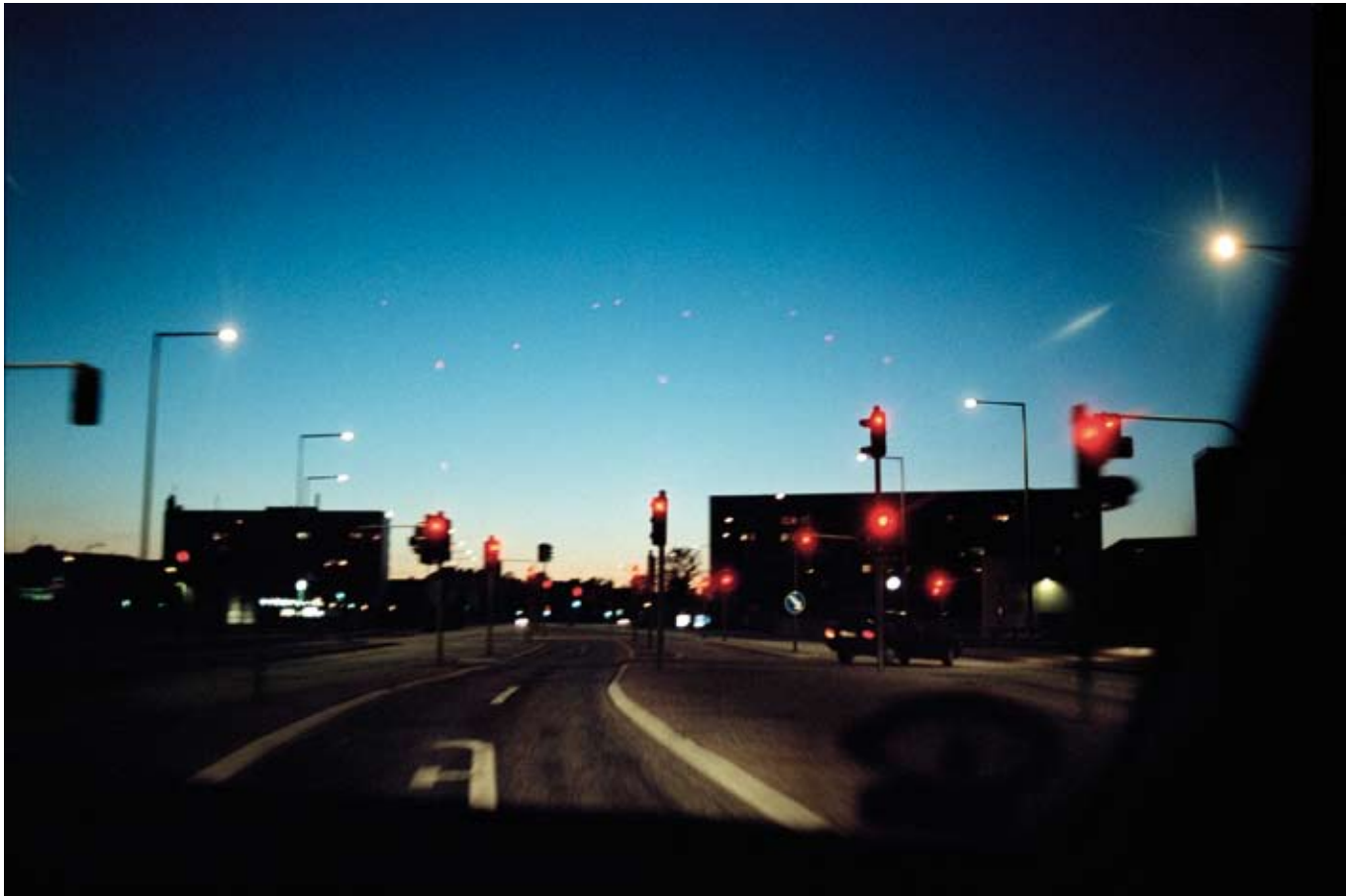
Birgitta Lund: In Transit (Red Lights, Copenhagen)