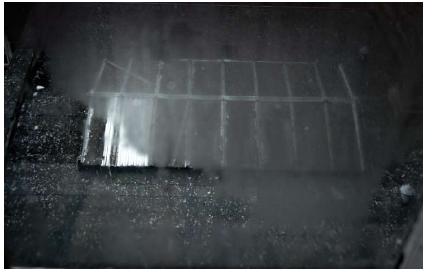
Brigitta Lund: In Transit (Window, Copenhagen)